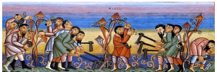
Parable of the Workers in the Vineyard [Codex aureus Epternacensis]