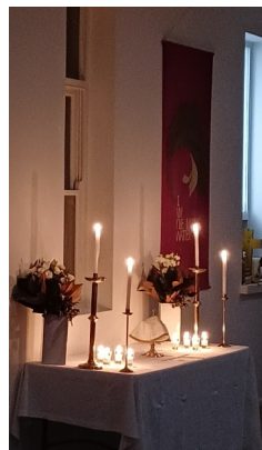
The Altar of Repose, Holy Thursday Evening