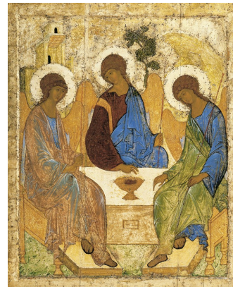
The Trinity is an icon created by Russian painter Andrei Rublev in the early 15th century.

Please bring all items to the Parish Office