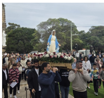
The 2025 Procession

On Sunday 24 May 2026 following the 10am Mass at HNOM, there will be a Procession of Our Lady around the grassed area outside the Chapter Hall. This will then be followed by The Rosary and morning tea in the Parish Hall, pro- vided by Legion of Mary. Please join us.